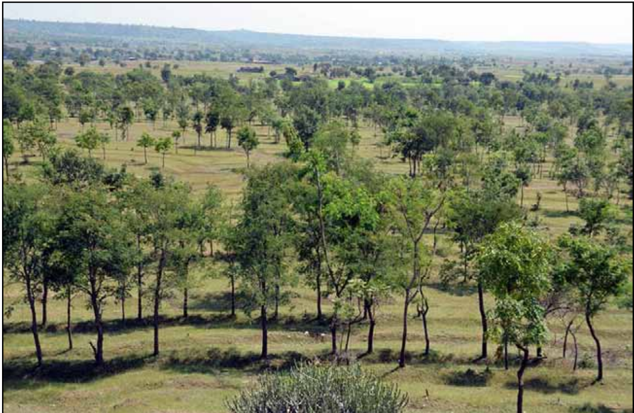
INDIA: Darewadi project, 2012. Watershed development treatment (continuous contour trenches and tree plantings) for rainwater retention and soil conservation. The watershed treatment was completed in 2002. See Watershed Organization Trust at www.wotr.org .

To ensure the implementation of the legislative process as specified in section 7.3, for the execution of actions, activities, and works that make up its contents, and to implement necessary legal and expert analysis, a team of professional and experts needs to be established in each country. The dynamics of the GAP require and assume that the above legislative process of economic incentives will begin in 2016 in individual countries.