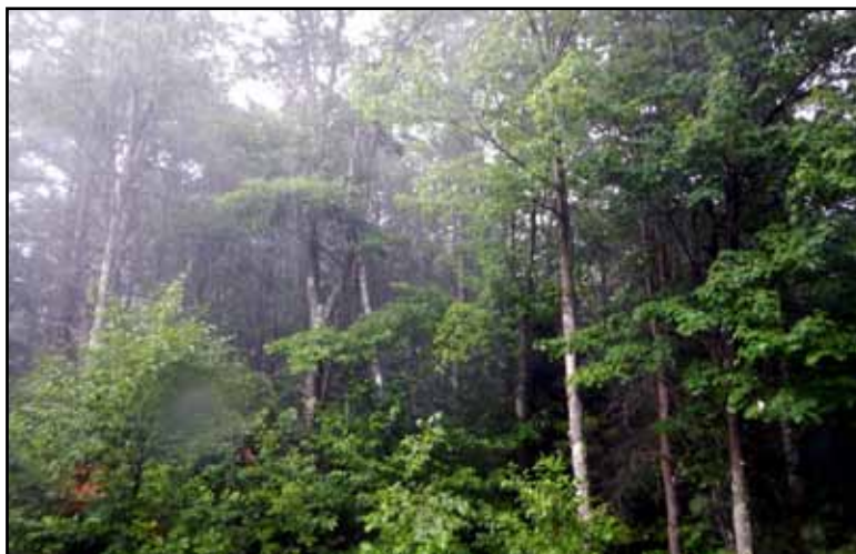
NATURAL FOREST: USA- State of New Hampshire-Forested areas provide excellent shading, infiltration, and transpiration to regulate small water cycles in the landscape.