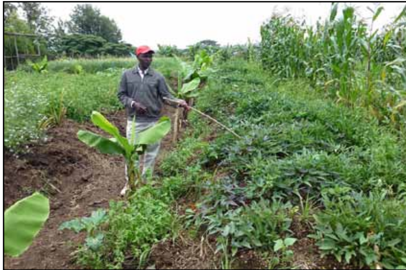
Jan Pokorný photo

renewal of water in ecosystems and the effective use of public resources. The monitoring of these start-up projects will be carried out by independent civil society groups.